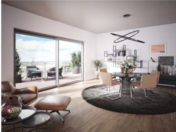
[heroyal S 65]

heroyal S 65 is an aluminium sliding door system for large passage openings in upscale residential and commercial buildings, characterised by an optimised production process.